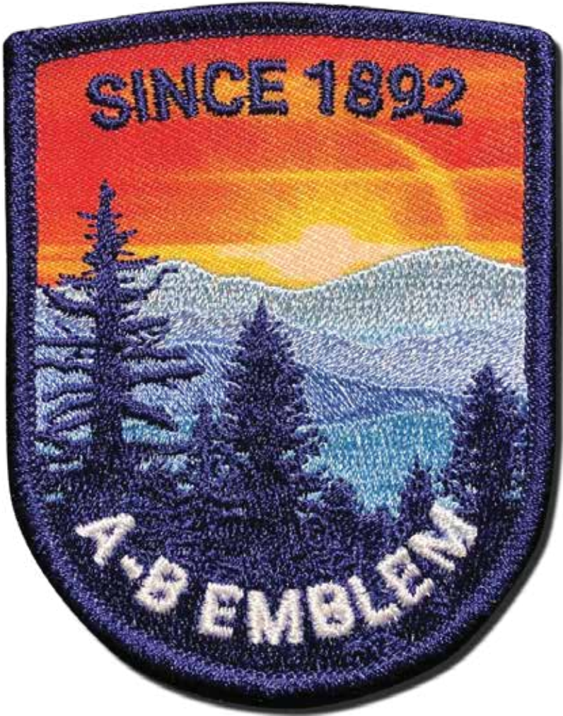
Photo patches and photo over (photo with embroidery) allow for small graphic elements and photographic details to be preserved. In this example, the sunset and sky were printed onto twill.