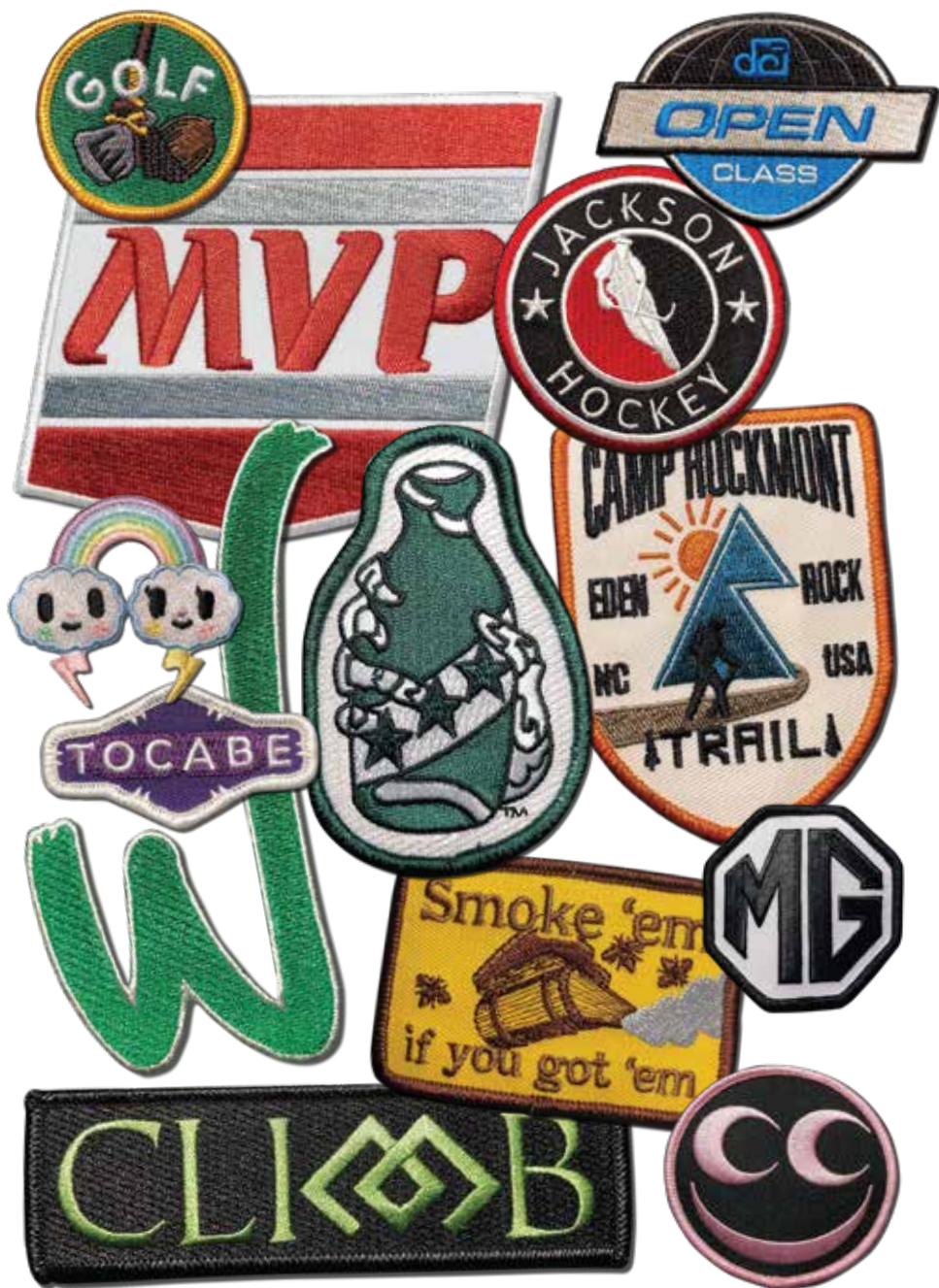
Every stitch counts!